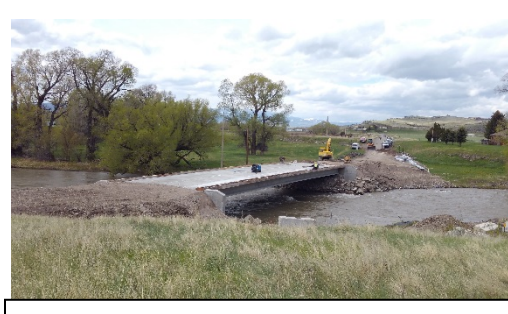
Bridge approaches built up