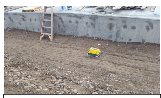
Backwall in place

Anticipated date for paving asphalt approaches is middle to late June. This date will be finalized and communicated to affected residents well in advance so the public can plan accordingly. The roadway closure for the approach paving and installation of bridge approach railing is anticipated for 3 to 4 days in duration.