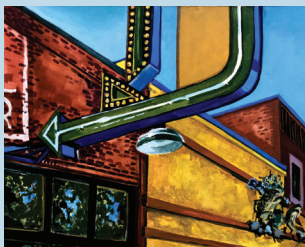
Les Herman, gouache

Local artists depict well-known (and obscure) cultural sites but their locations are not identified in this exhibit. To test people's cultural landscape knowledge, we are holding a contest (with prizes) at the exhibit opening. Afterward, a worksheet with possible locations will be available. Located upstairs in the Expedition Room through September 2019. Most pieces are available for purchase, benefiting the museum. Sponsors are: CTA Architects and Engineers, and the Friends of YGM.