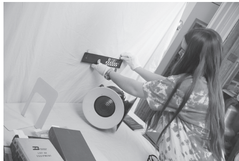
(Below) When the project is complete the museum's displays will more closely resemble the cases and information present in the recently updated Native Cultures Room by Marsha Fulton and others.