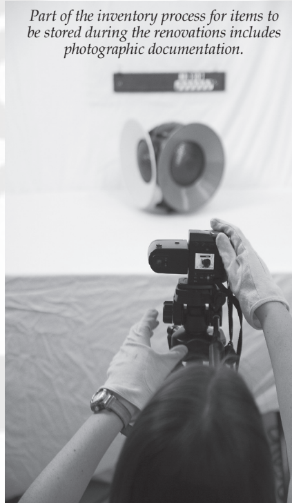
Part of the inventory process for items to be stored during the renovations includes photographic documentation.

work and archives. UV light will also degrade cloth, leather and wood. We want to protect our collections so that people can enjoy them for many years to come.