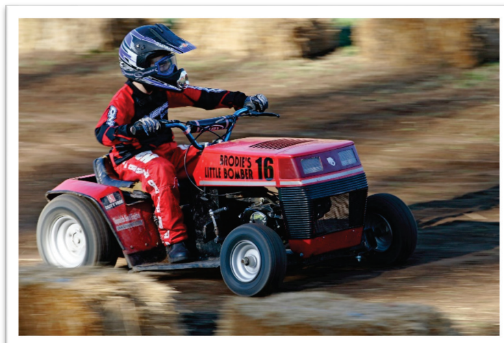
Shields Valley FFA Lawn Mower Races, Thursday, July 26 at 7 PM