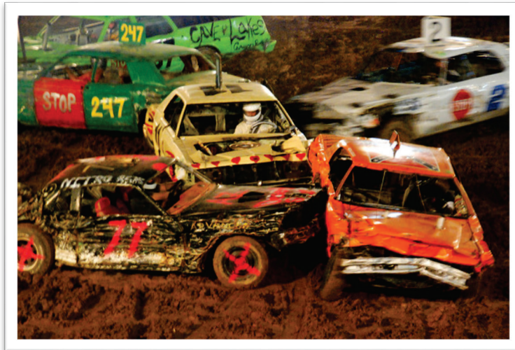
Demolition Derby at the Park County Fair – Sunday, July 29 at 1 PM

Ticket Prices: 13 years – Adult: $10; 6-12 years: $5; 0-5 years: No Charge; Family 4 Pack: $35