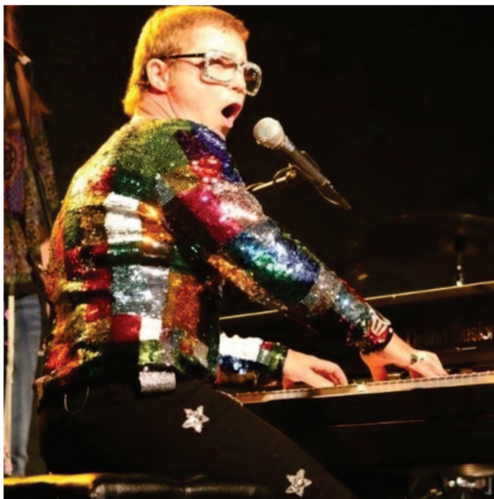
Considered one of the world's greatest tribute bands!

This is a show that transports the crowd to the early career of Elton John's music. The hits sound magical and perfect from "Benny and the Jets" to "Rocket Man" to "Goodbye Yellow Brick Road".